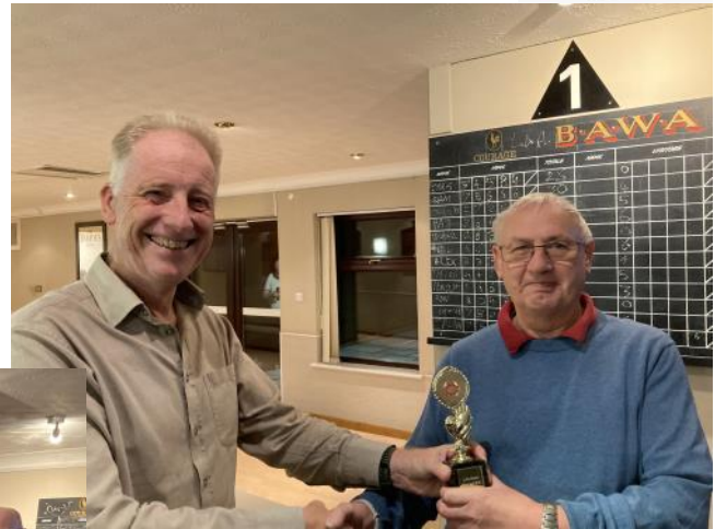
The BAC and Bristol Strut teams