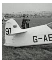
Percival Mew Gull

Just one reply to last month's pictures—from Alan, correct as always!