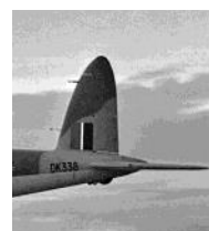
de Havilland Mosquito

When David Ogilvy's latest book is published (soon, I hope) you will be able to read about his experiences with them.